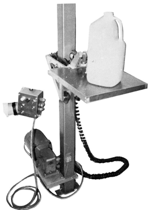
FIG. 1 Apparatus for Dropping Containers